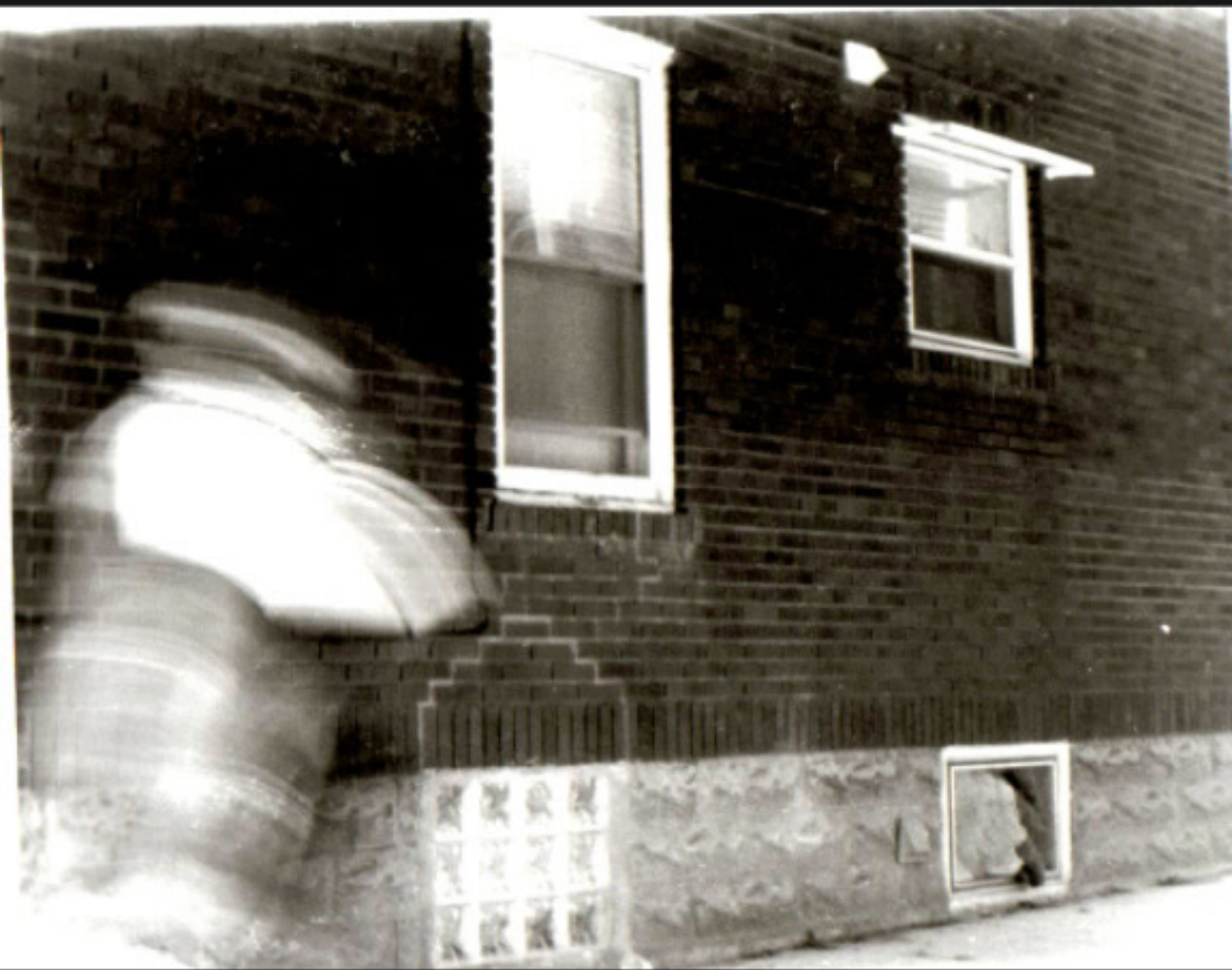
BLUR MATTHEW RISSELL